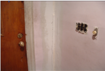
Note open access panel

Holes and cracks in the envelope were observed through out the first and second floors. Seal all holes and gaps, including light switches and electric outlets on outside walls.