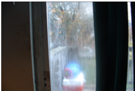
Sliding glass door

Den's sliding door needs to be repaired due to noted gaps and air leakage.